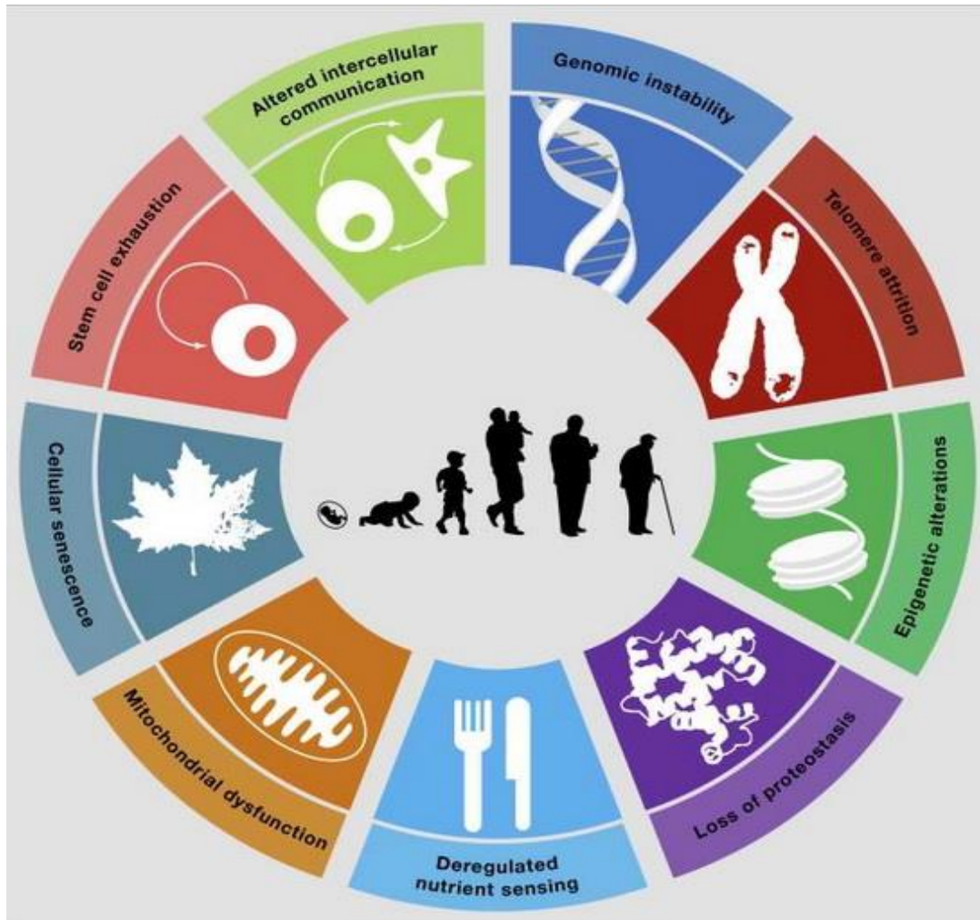
This graph illustrates the nine hallmarks of aging as described in this Review. Reference: Cell Press.